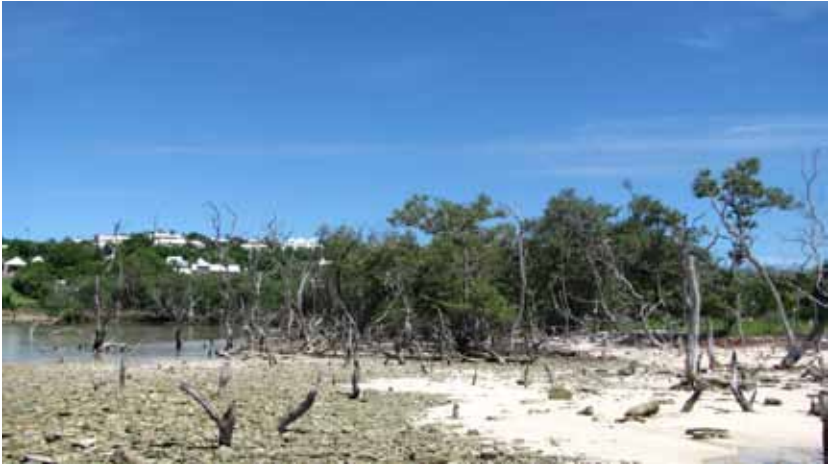
Figure 3. View to the north of the western seaward edge of Hungry Bay in 2010, prior to Hurricane Igor's impact. Notice the extensive dead mangrove stumps and trunks. All rubble and sand in the foreground was deposited there by Hurricane Fabian and extends off to the northeast about 100 metres into the mangrove, along the shoreline.

Dr. Robbie Smith Curator, Natural History Museum Dept of Conservation Services