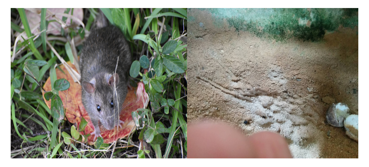
Figure 8. (Left) An introduced black rat; (right) rat prints and a devoured tropicbird egg inside an artificial nest-cavity.

Furthermore, the roots of introduced plants, especially the casuarina ( Casuarina equisetifolia ), penetrates into and erodes the rocky coast, which further degrades tropicbird nesting habitat. At sea tropicbirds are harassed (and occasionally killed) by avian kleptoparasites (e.g. Skuas and Jaegers from the Family Stercorariidae). These pelagic, transient seabirds cause tropicbirds to regurgitate food items and then consume the items afterwards.