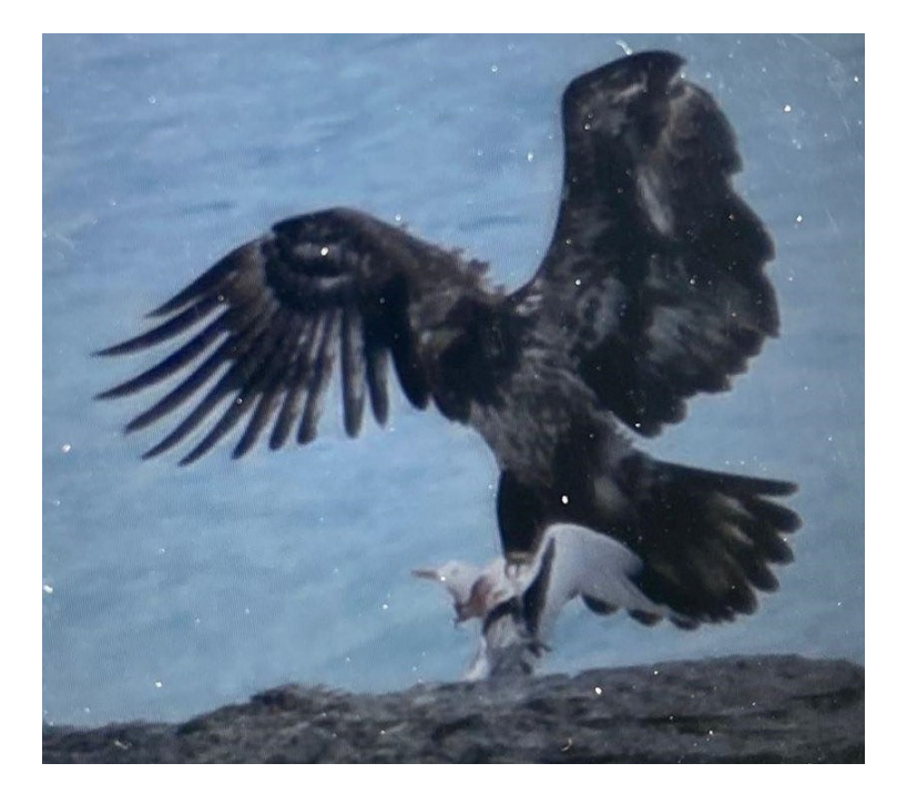
Figure 10. An immature Bald Eagle with an adult White-tailed Tropicbird in its talons. (Note this could be the first published record of a Bald Eagle preying on a member of the Family Phaethontidae). on Bermuda (April 27, 2022).