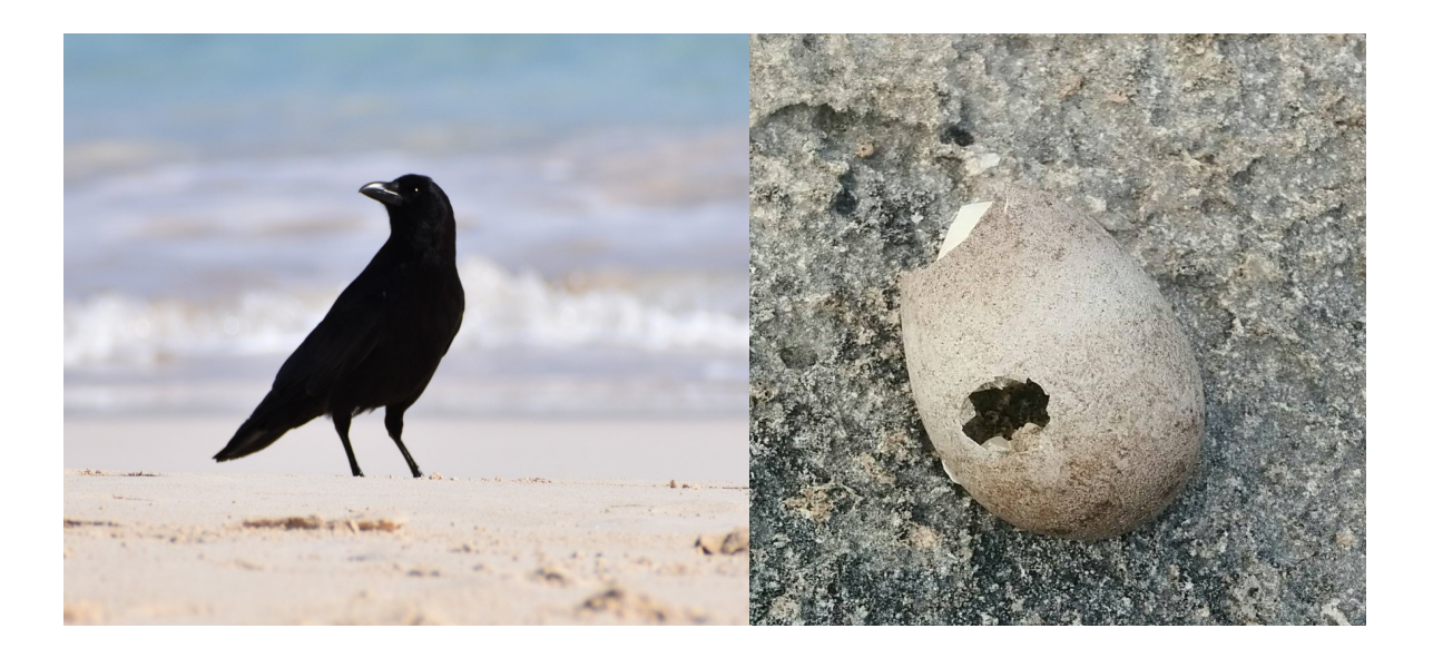
Figure 9. (Left) an introduced American Crow; (right) a crow-predated tropicbird egg from Bermuda.