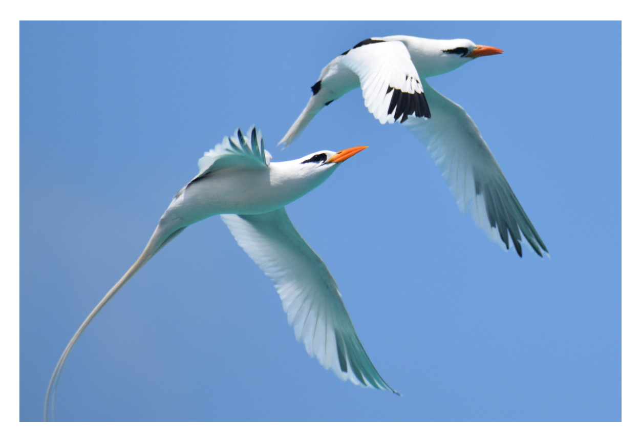
Figure 4. Two adult White-tailed Tropicbirds from Bermuda engaged in aerial courtship. The top bird in this photograph has moulted its tail streamers.