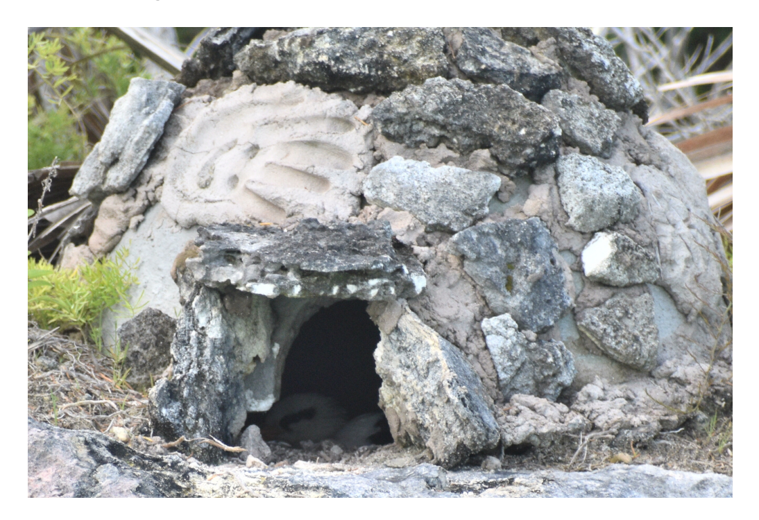
Figure 11. Artificial "igloo" nest-cavity with an adult tropicbird sitting inside.

While the foam igloos are readily accepted by nesting tropicbirds, they are an environmental hazard if and when they are destroyed by storms, given that they are made of (polystyrene) foam. As a form of plastic, this is an ingestion risk and possesses a wider environmental hazard. On way to remedy this is to construct 'igloos' out of limestone slate using the same dimensions as the foam ones.