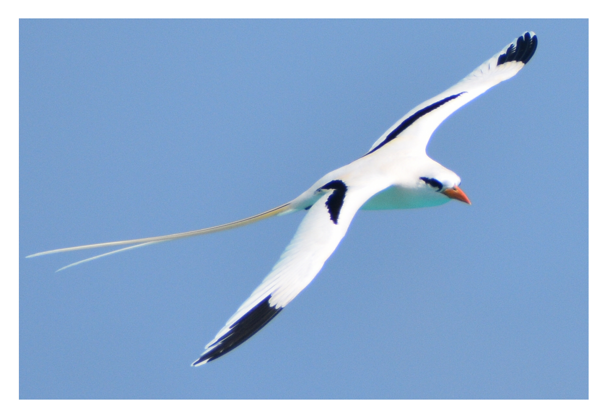
Figure 1. An adult White-tailed Tropicbird flying in Bermuda. (Note the blue ocean hue reflecting off white underparts).

From hatching to fledging, the appearance of nestling longtails undergo significant changes (see "Reproduction" below for more details). Just prior to fledging, immature longtails are nearly the same size as adults, albeit heavier. Like adults, their plumage also comprises mostly white feathers with some black markings, but the entire back and inner wing is covered with black chevron marks, as opposed to the diagonal bars (Fig. 2.). The most notable difference is the absence of the two long tail "streamers", which are acquired during adulthood while at sea. The bills of juveniles are a horn colour and are less serrated than adults. Their legs and feet, however, are entirely black, like adults.