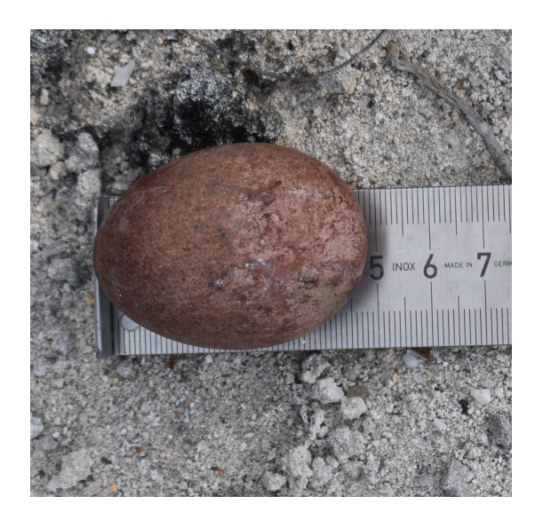
Figure 5. A Bermudian White-tailed Tropicbird egg.