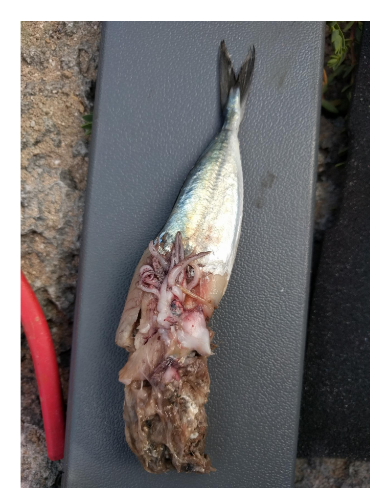
Figure 7. Regurgitated fish ( Decapterus sp. ) and squid from a Bermuda White-tailed Tropicbird.