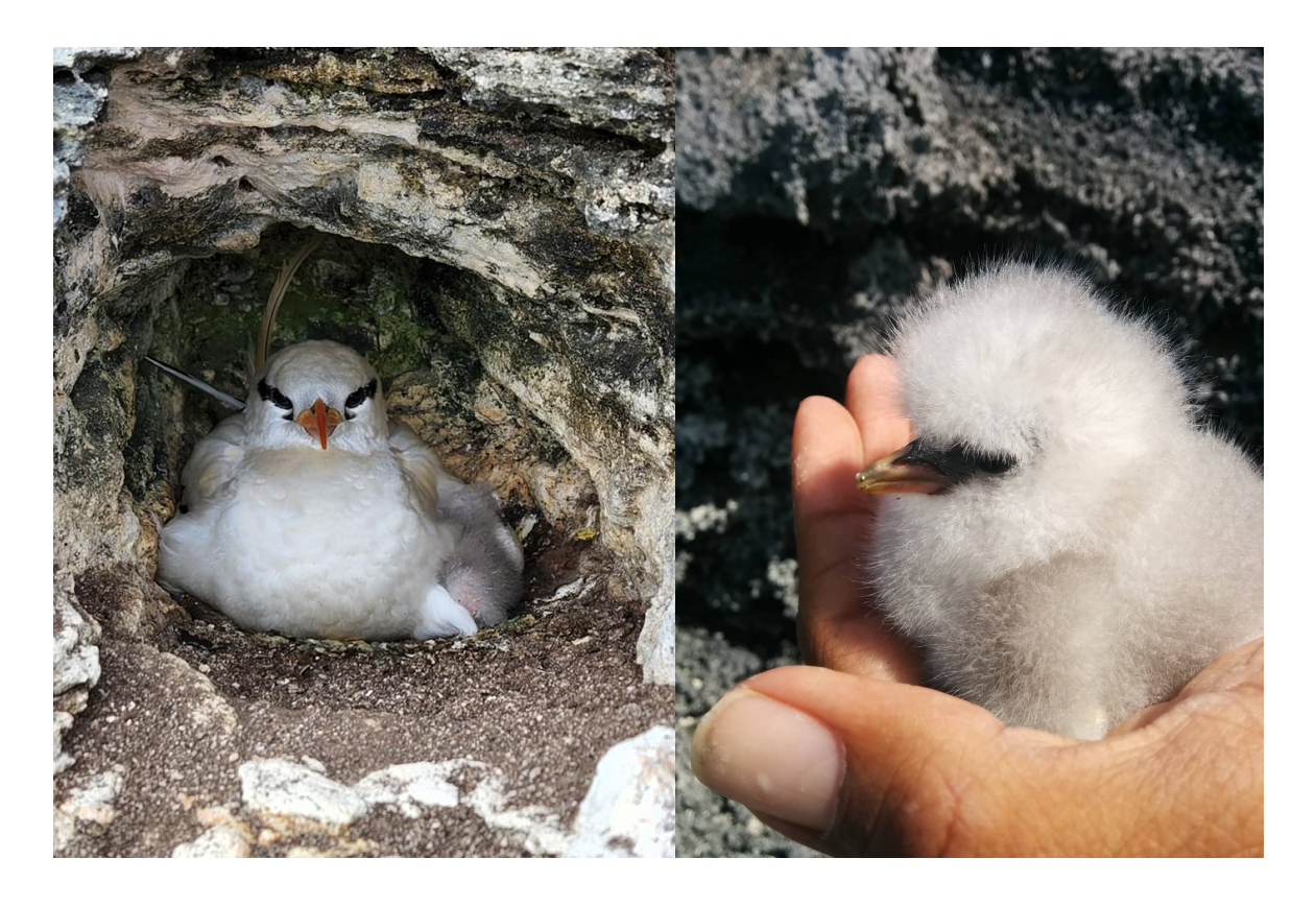
Figure 6. (Left) An adult White-tailed Tropicbird in Bermuda brooding a downy chick (small grey fluff on lower right side); (right) a newly hatched Bermuda tropicbird.