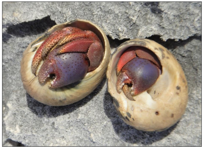
Figure 2: Two C. clypeatus retracted into C. pica shells, showing enlarged purple claw.

Coenobita clypeatus can be distinguished from other terrestrial crab species in Bermuda by its use of a gastropod shell, the narrow shape of its head and body, and the bright purple colour of the biggest front claw in larger animals.