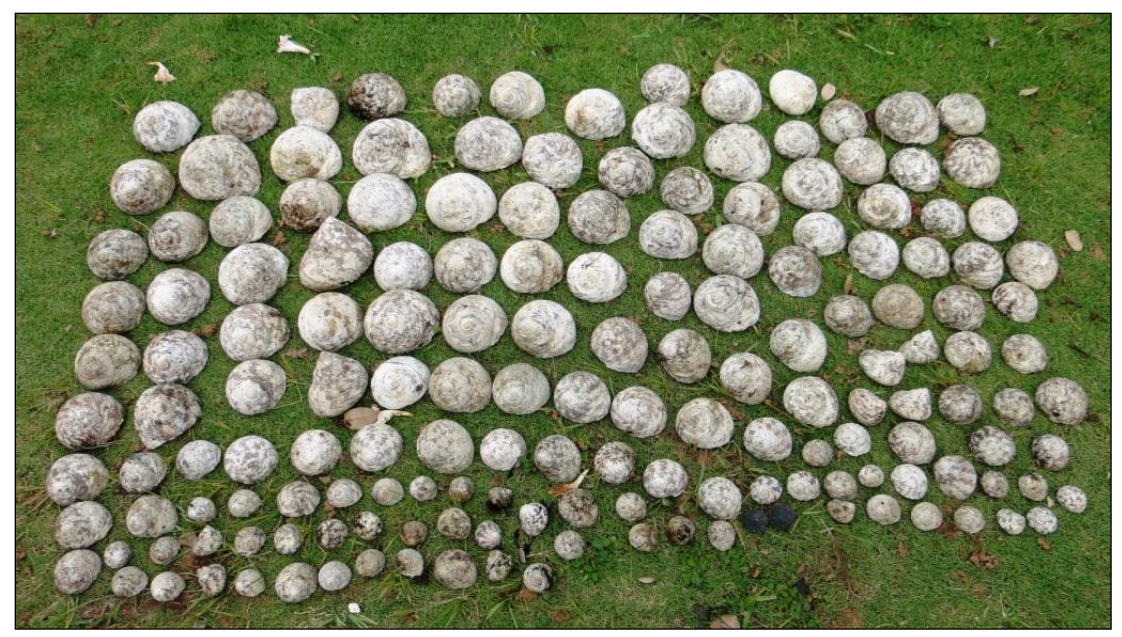
Figure 6: The 165 illegally harvested West Indian topshells ( Cittarium pica ) donated to DENR in 2011.

It is possible that illegal collection of land hermit crabs for fishing bait or pets still occurs in Bermuda, but it is unlikely to be substantial given low crab numbers and ready availability of alternatives. It is possible that hermit crabs could cause damage to crops and coastal gardens, however in Bermuda the targeted killing of land hermit crabs is prohibited by the Protected Species Act 2003. These issues can be dealt with through education, compromise and the mitigation measures permitted by the Protected Species Act 2003.