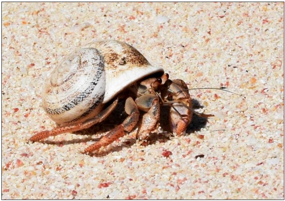
Figure 1: A juvenile Coenobita clypeatus utilising the shell of the terrestrial snail Otala lactea , south shore Bermuda.

The total cost of management actions cannot be defined at this point. Funding needs to be secured through non-governmental organizations (NGO's), overseas agencies, and other interested parties for implementing the necessary research and monitoring, awareness and management activities. Developing budgets and securing funds for each action are the responsibility of the leading party as outlined in the work plan.