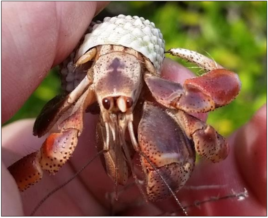
Figure 4: A young Coenobita clypeatus in the shell of a beaded periwinkle ( Tectarius muricatus ). This crab was found in a shell-poor environment and is using a shell that is too small for its body.

In Bermuda the shell most often used by land hermit crabs of all sizes is the West Indian topshell ( Cittarium pica ). Other shells that have been observed being used by younger crabs include those of the beaded periwinkle ( Tectarius muricatus ) (Fig. 4) and several species of nerites ( Nerita spp. ). On occasion land hermit crabs have been observed utilising shells from terrestrial snails such as the milk snail ( Otala lactea ) (Fig. 1), but this is relatively uncommon and may be due to the inappropriate internal shape of the shell, or because it is relatively thin compared to marine molluscs. Walker (1994) reported Coenobita clypeatus from Hungry Bay using primarily Cittarium pica shells, but also rarely mangrove periwinkle ( Littorina anguilifera ), and four-toothed or variegated nerite ( Nerita versicolor ). Godsall (2000) also reported one occurrence of a triton shell being used.